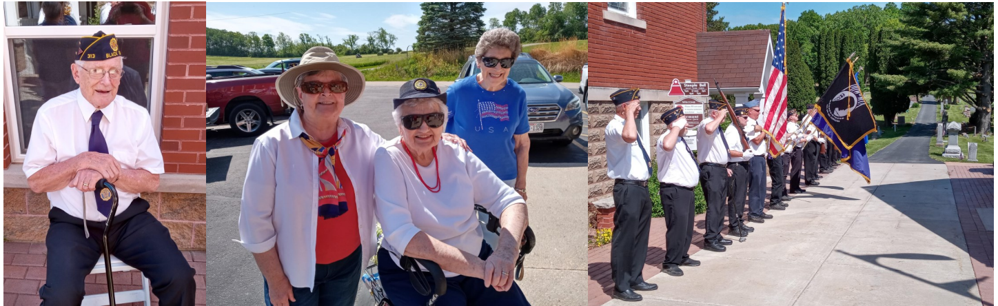
Memorial Day—remembering those who served