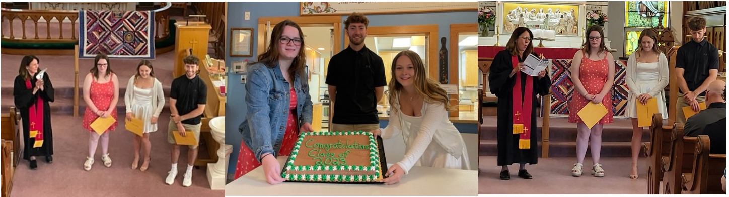
Class of 2023