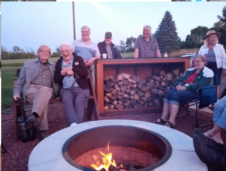
Some of the choir relaxing around the fire pit afterwards .