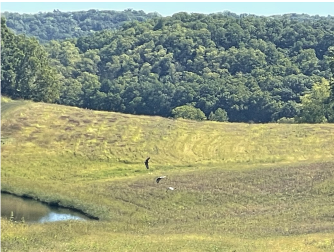
Sandhill Cranes flying through the prairie