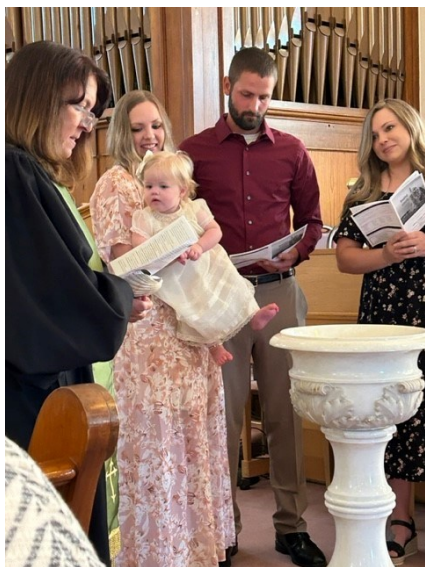
Baptisms are abound at Vermont Lutheran Church