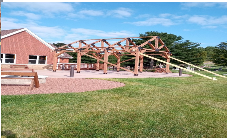
Framework Is All Up