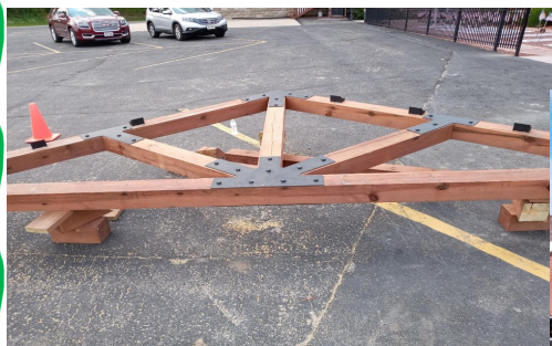
One Roof Truss with Brackets