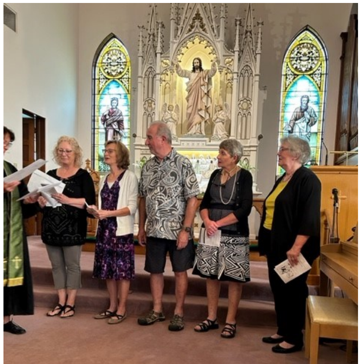
Recognition of the Assistant Ministers. Thank you for all that you do!