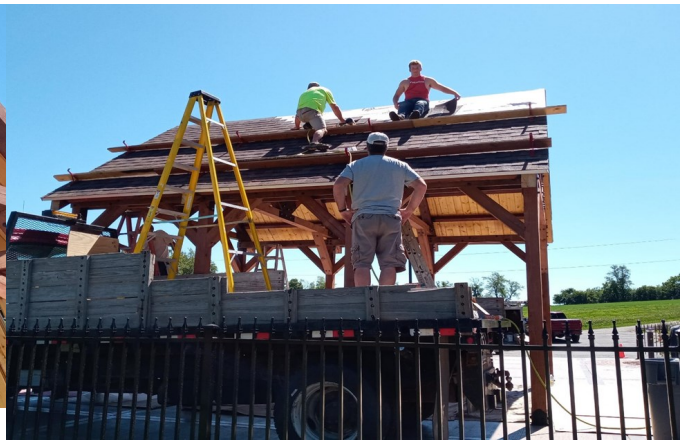
Shingles Going On