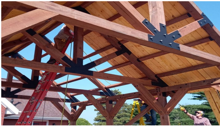
Roof Boards Going On