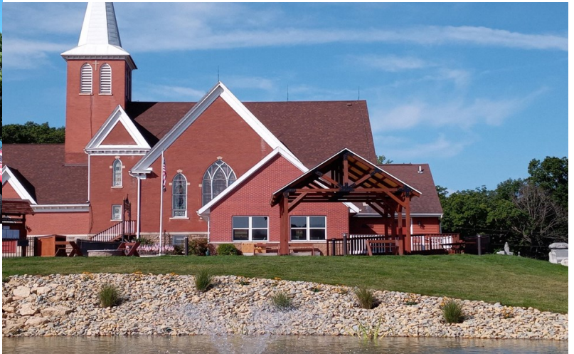
The Finished Product!

Shelter in the Woods: We know that lots of folks have been driving up the cemetery extension road to the top of the hill to enjoy the views. Plus, it's a great place to start a hike on a couple of the woodland trails or around the top-of-the-hill prairie field. We'd already cleared an area in the woods to have a shady place to sit, so why not a small shelter with a table and a couple of benches to accommodate a picnic or snack?