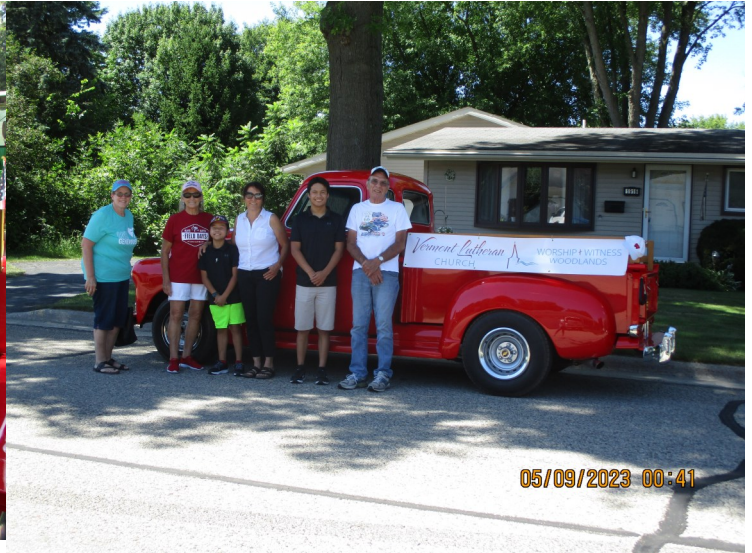
Our fun at the Black Earth parade. We all like the new banner! It's super nice!