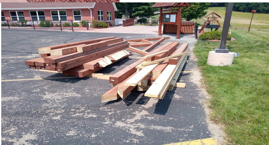
Lumber awaiting the construction

Work on the shelter began right after the Community Picnic, August 20 th , and was completed September 1 st ! Here are pictures taken from start to finish: