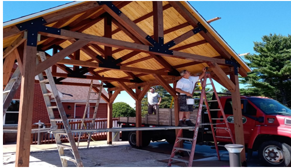
Inside Finish Coat and Trim