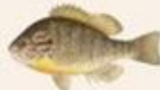
PUMPKINSEED Lepomis gibbosus