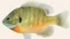
BLUEGILL Lepomis macrochirus