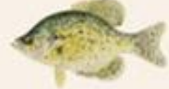
BLACK CRAPPIE Pomoxis nigromaculatus