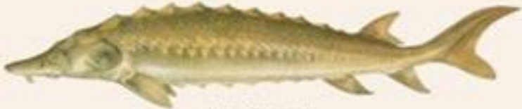
LAKE STURGEON Acipenser fulvescens