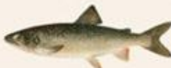
LAKE TROUT Salvelinus namaycush