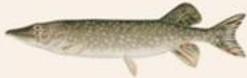
NORTHERN PIKE Esox lucius