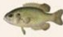
ROCK BASS Ambloplites rupestris