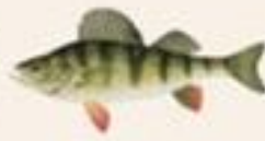
YELLOW PERCH Perca flavescens