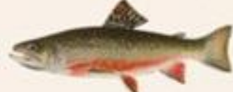
BROOK TROUT Salvelinus fontinalis