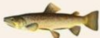
BROWN TROUT Salvelinus fontinalis