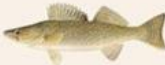
WALLEYE Stizostedion vitreum