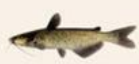
CHANNEL CATFISH Ictalurus punctatus