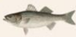
WHITE BASS Ambloplites rupestris