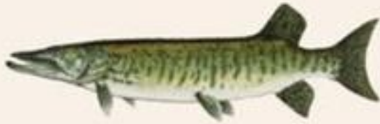
MUSKELLUNGE Esox masquinongy