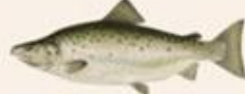
CHINOOK SALMON Oncorhynchus tshawytscha