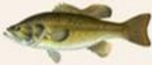
LARGEMOUTH YELLOWFISH Perca flavescens