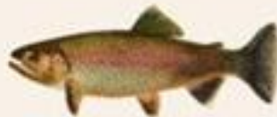
STEELHEAD Salmo gairdneri