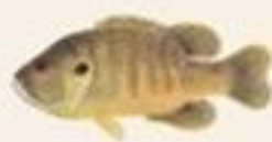
GREEN SUNFISH Lepomis cyanellus