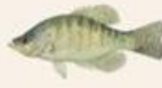
WHITE CRAPPIE Pomoxis annularis