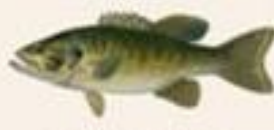
SMALLMOUTH YELLOWFISH Perca flavescens