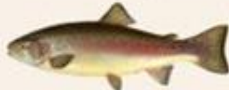
RAINBOW TROUT Salmo gairdneri