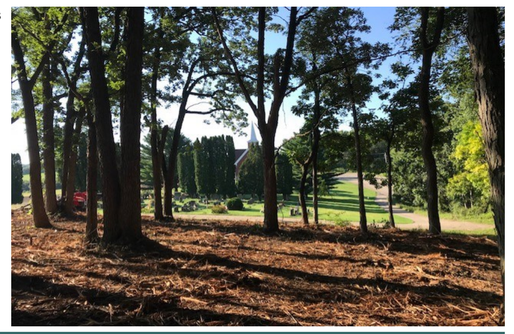
The Cemetery View

An area for scattering cremains known as the Vermont Memorial Forest will be established in the woods just north of the current cemetery. It will be left in a natural state with low growing grass with a natural forest-like setting.