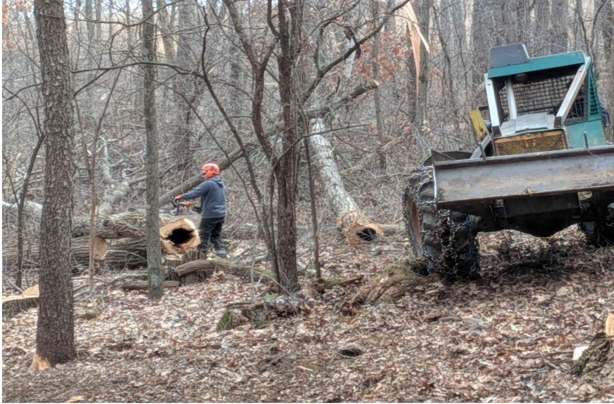
Careful felling of the Aspen/Poplar trees left good trees behind. Note the hollow trunks on the felled trees.