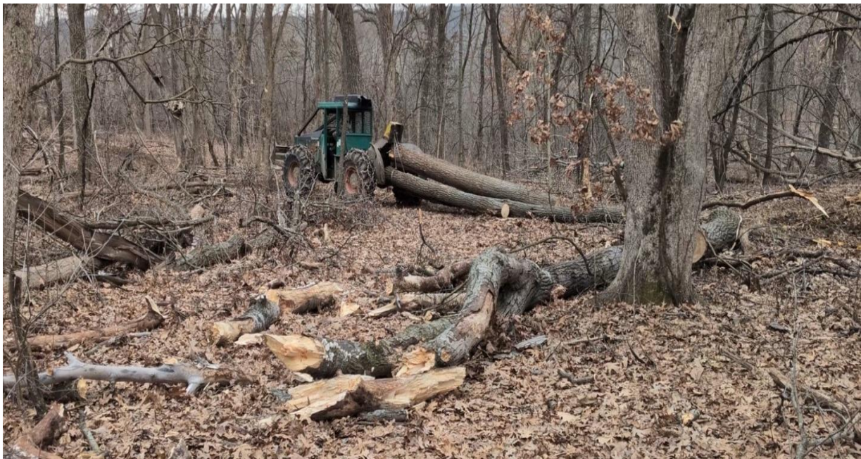
Moving the downed tree trunks to the collection area.